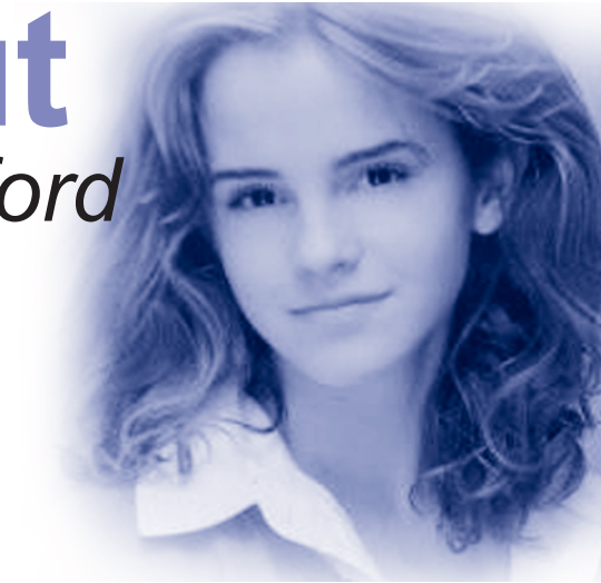
Above: Emma Watson

There was also an exhibition of sculptures by Alec Worster that sets out to use art as a tool for change on behalf of homeless people everywhere. Exiles in their own land, citizens yet excluded by the city, homeless people