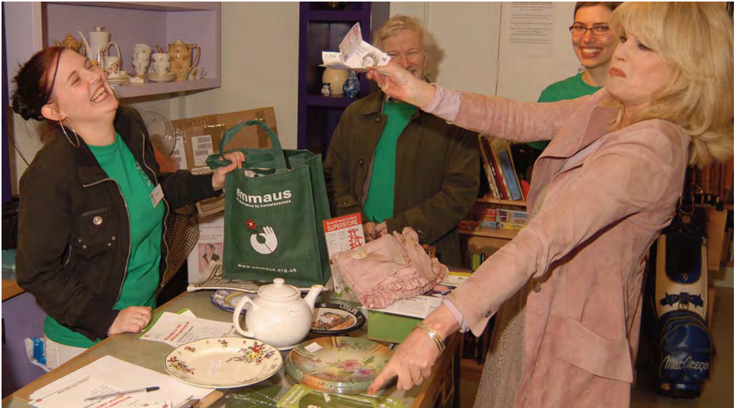
Pointedly funny: Joanna Lumley has people in stitches during her wildly successful visit to Emmaus South Lambeth

Film and TV star Joanna Lumley swept into West Norwood to officially open the new accommodation block of Emmaus South Lambeth making it a fun-filled day for adults and children.