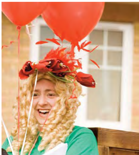
Hair apparent: stilt walker promoting the opening