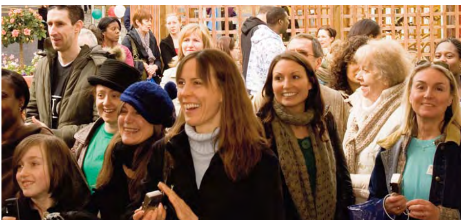
Crowd pleaser: a day enjoyed by all