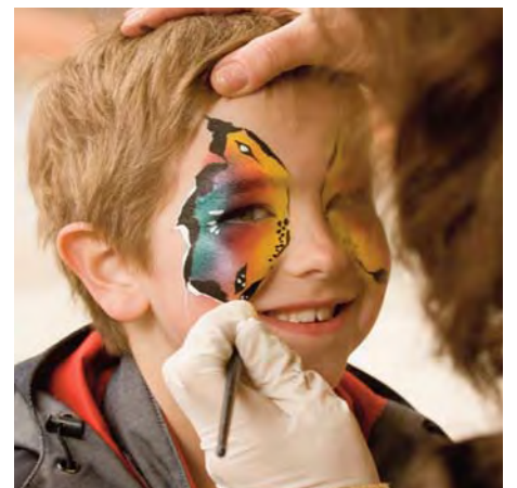
What a cheek: face-painting was popular