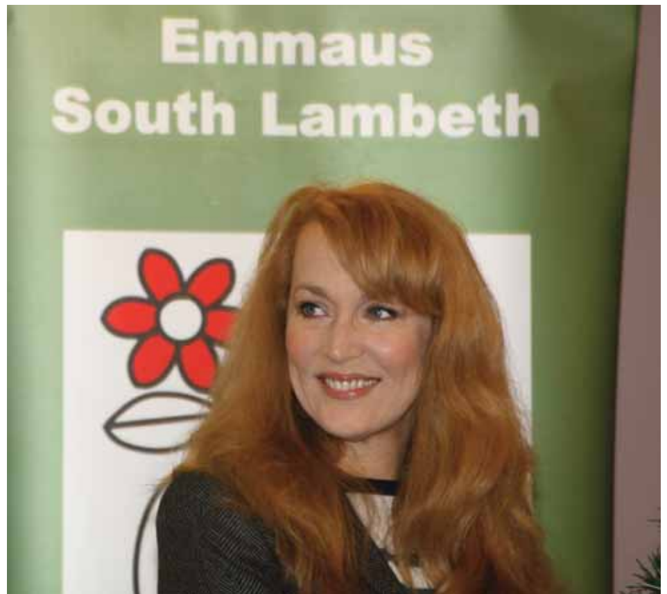
The eyes have it: Jerry Hall shows her support for Emmaus South Lambeth

In an interview with the Emmaus South Lambeth Newsletter Jerry Hall said: "People are surprised how bad luck can happen to anyone, fall on hard times."