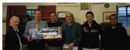
ESL trustees join staff at Emmaus Bristol in their warehouse