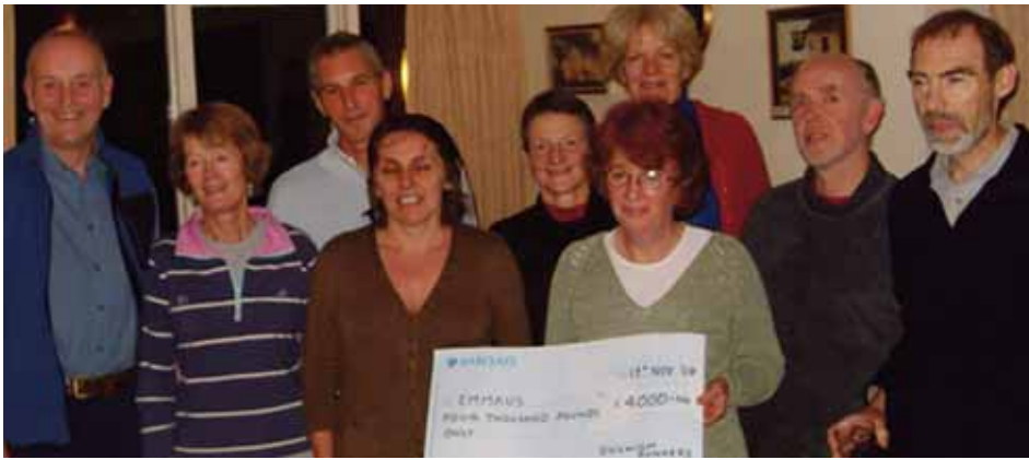
Grand gesture: Dulwich Runners present a cheque for £4,000 to Emmaus South Lambeth