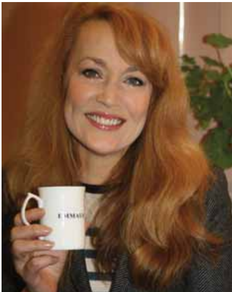
Mug shot: our celebrity guest enjoys some more tea