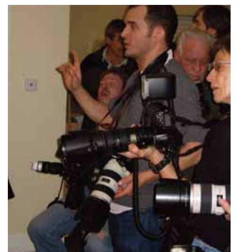
Focal point: professional photographers busy at Emmaus South Lambeth's accommodation building – to find out why turn to pages 4-5