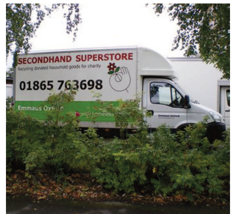
Above: Emmaus Oxford used the donation of £1,000 from Emmaus Gloucestershire towards the purchase of their van which is already being put to good use collecting and delivering furniture