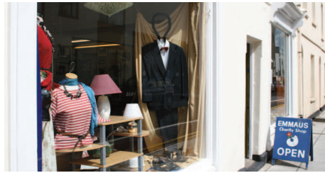
Above: Our fabulous window displays pull in the punters at Cheltenham

Over a period of four weeks, Companions assisted in repairing and decorating the old shoe shop which had been vacant for years and had suffered from water damage. While the decorating was being completed, Companions, staff and volunteers prepared stock in