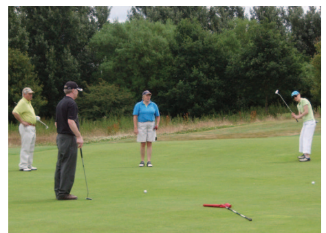
Above: Golfers giving it their all for Emmaus Gloucestershire

For more information about Fosseway Living - a registered social landlord that provides housing services to over 7,000 households in the Cotswolds and surrounding counties - call 0845 050 4034 or visit www.fosseway.com .